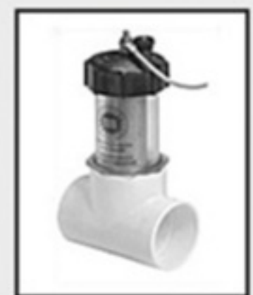
PART# 104-D 2" Slip x Slip New Install