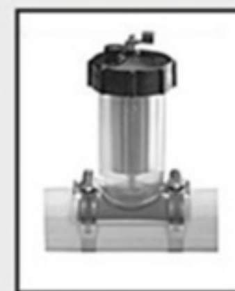
PART# 104-C 1.5" & 2" Retrofit