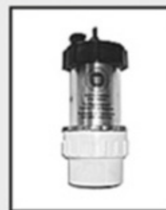
PART# 104-D SPIGOT Fits into any standard 2" Tee